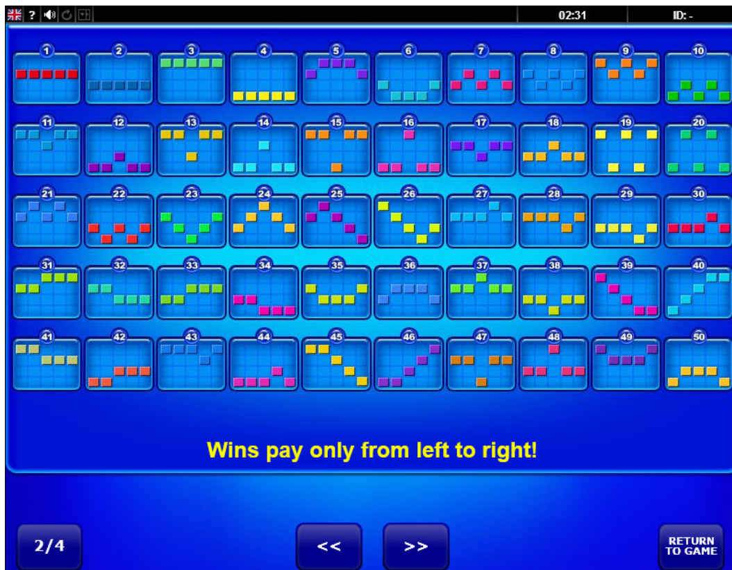
Help Screen 2