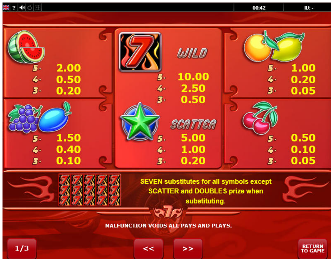
Help Screen 1