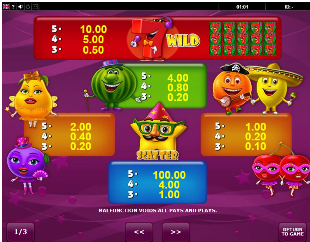
Help Screen 1