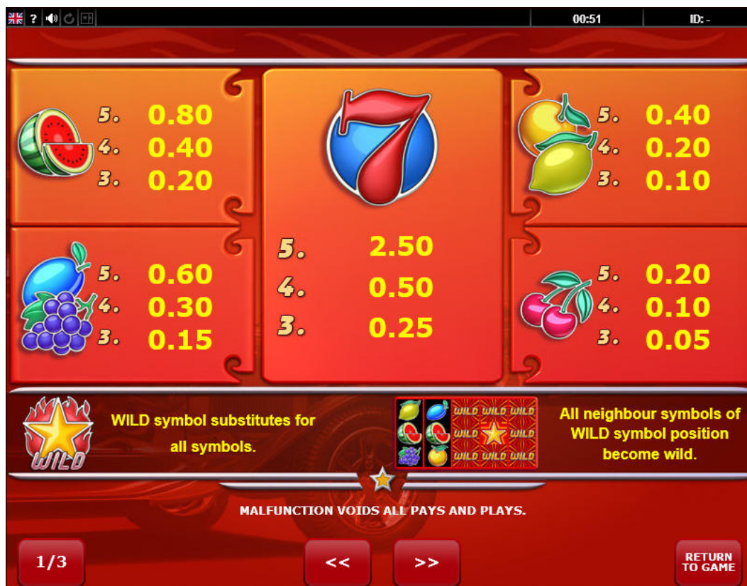
Help Screen 1