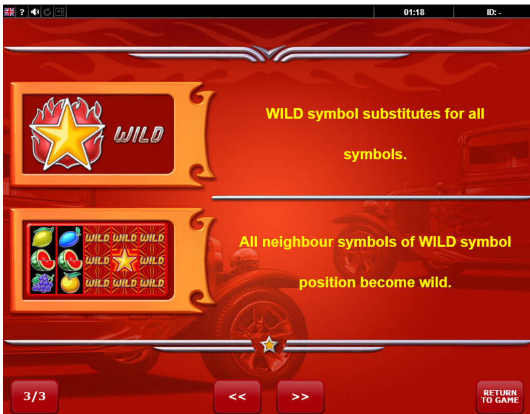
Help Screen 3