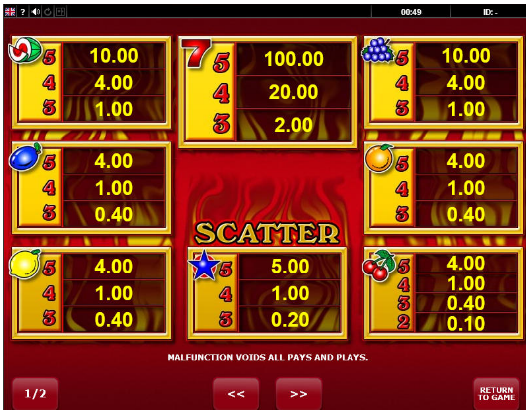
Help Screen 1