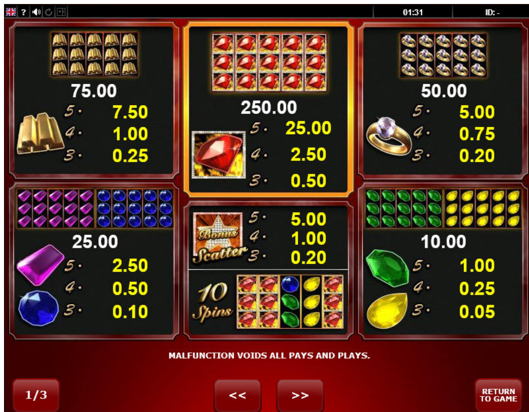
Help Screen 1