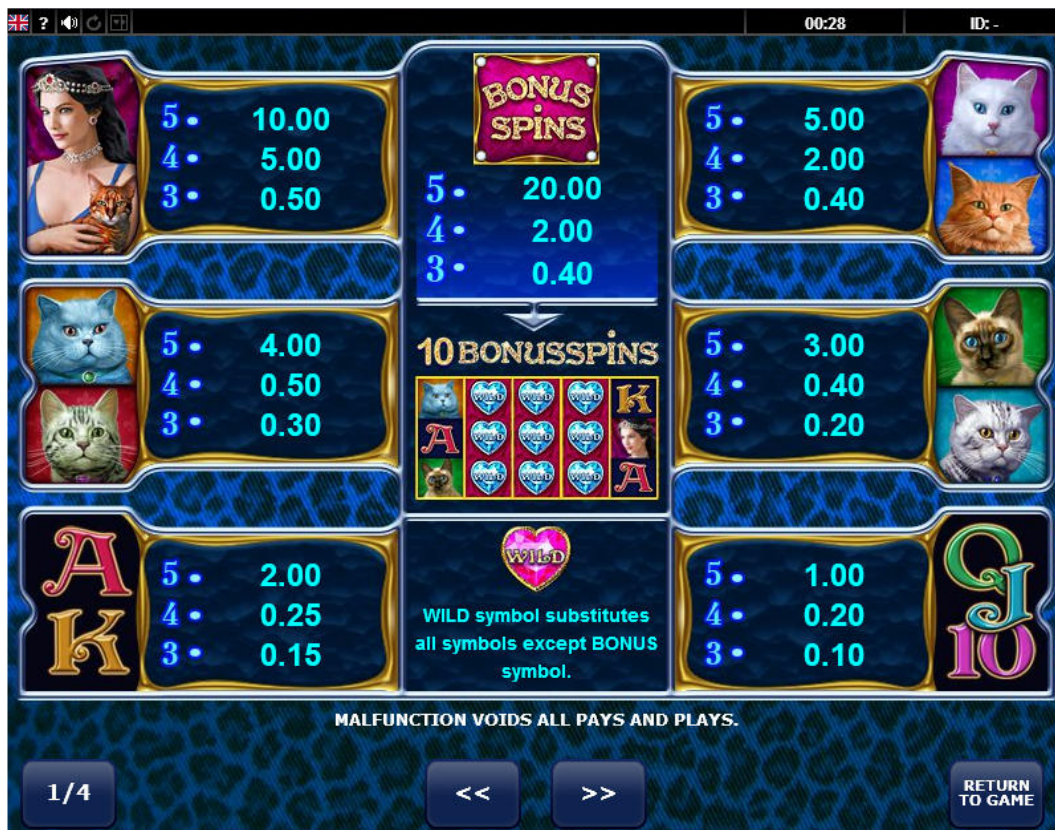
Help Screen 1