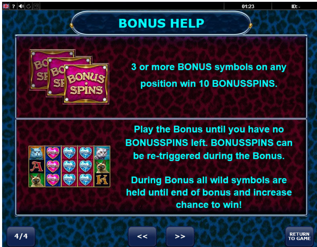
Help Screen 4