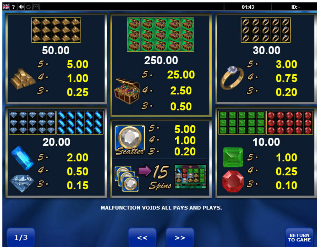
Help Screen 1