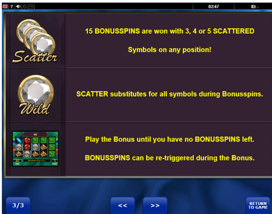
Help Screen 3