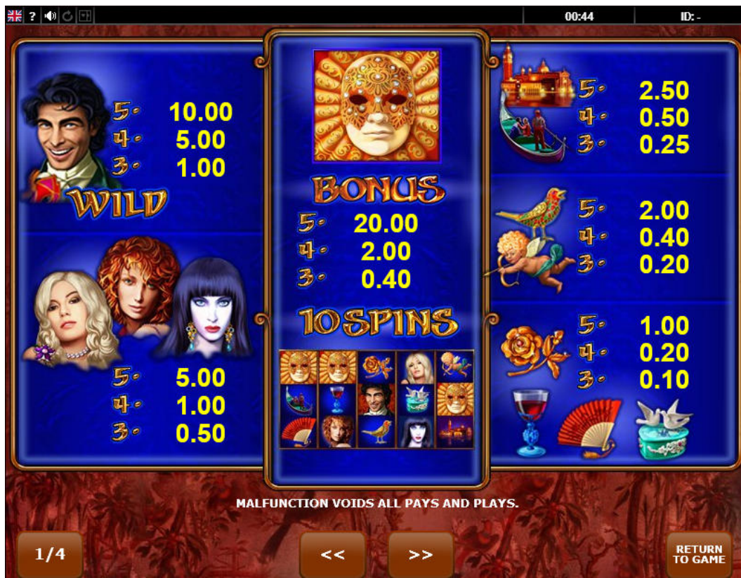
Help Screen 1