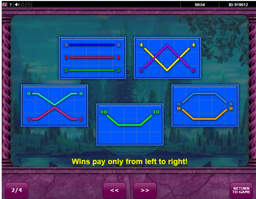
Help Screen 2