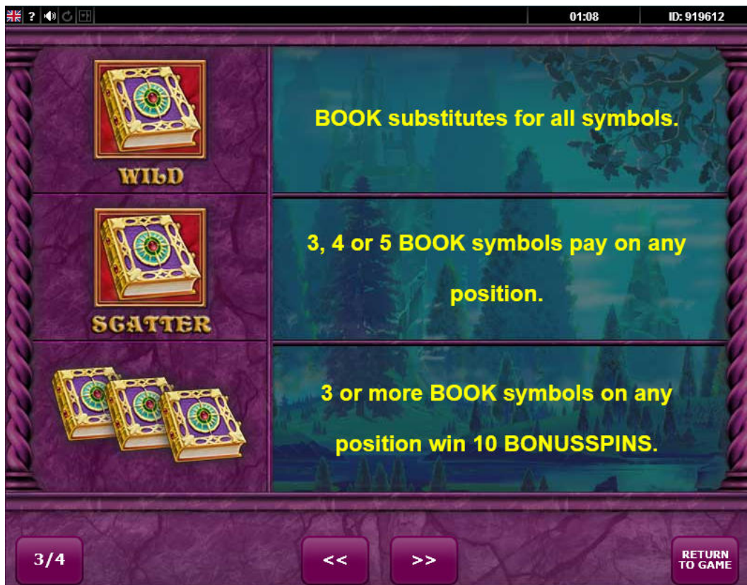
Help Screen 3