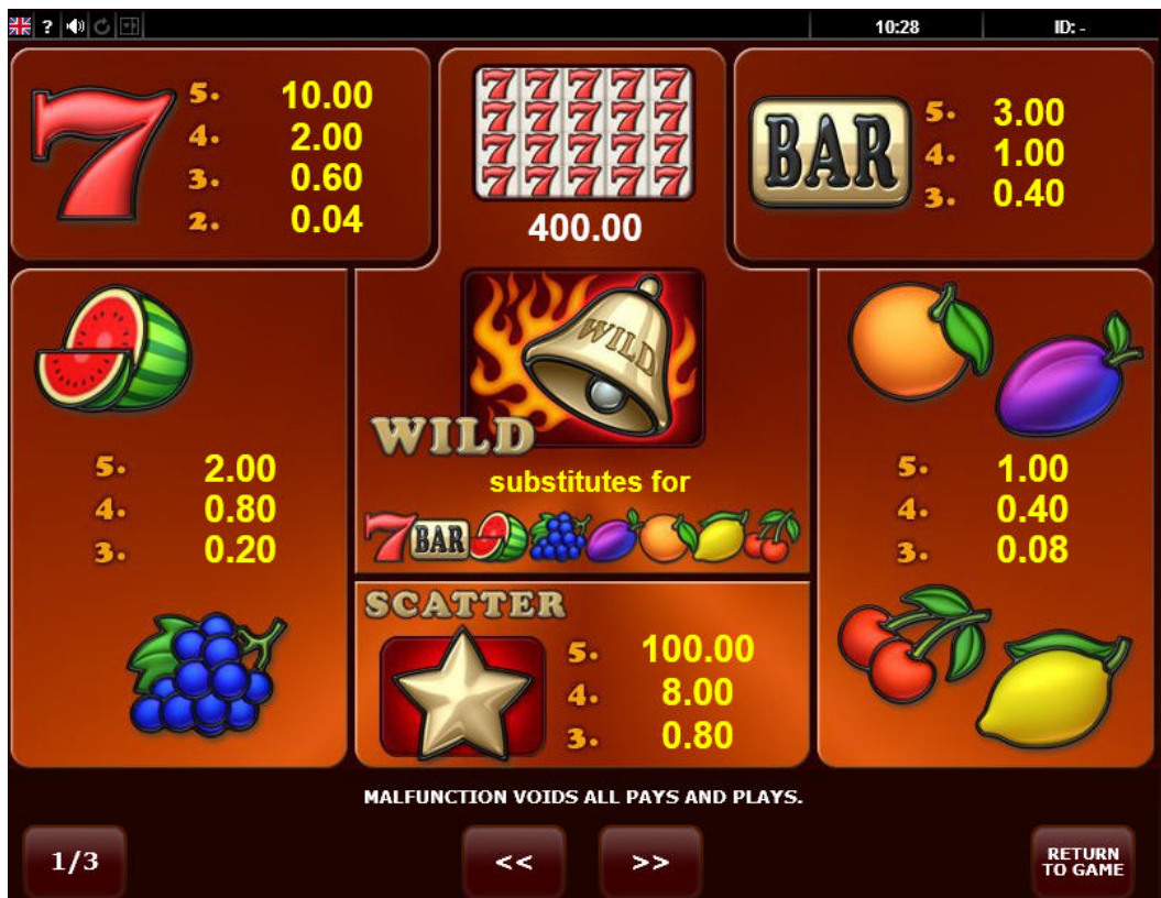
Help Screen 1