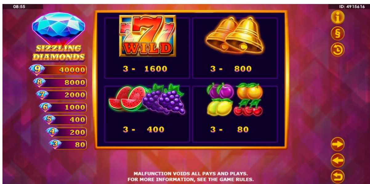
Help Screen 2