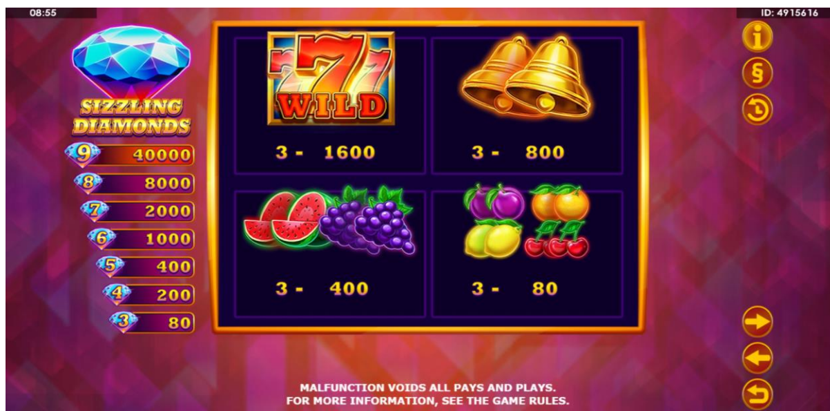
Help Screen 1