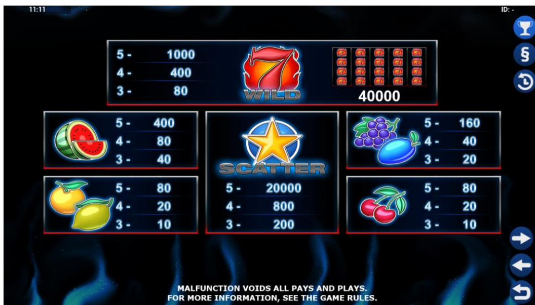
Help Screen 1