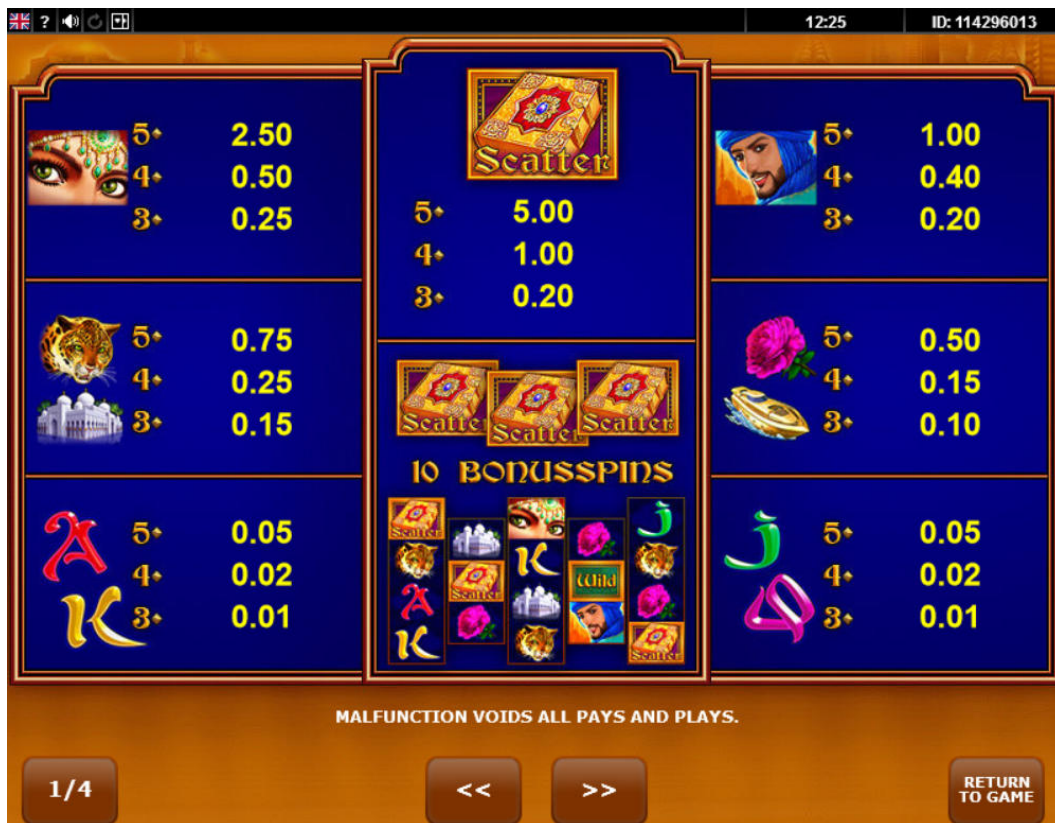
Help Screen 1