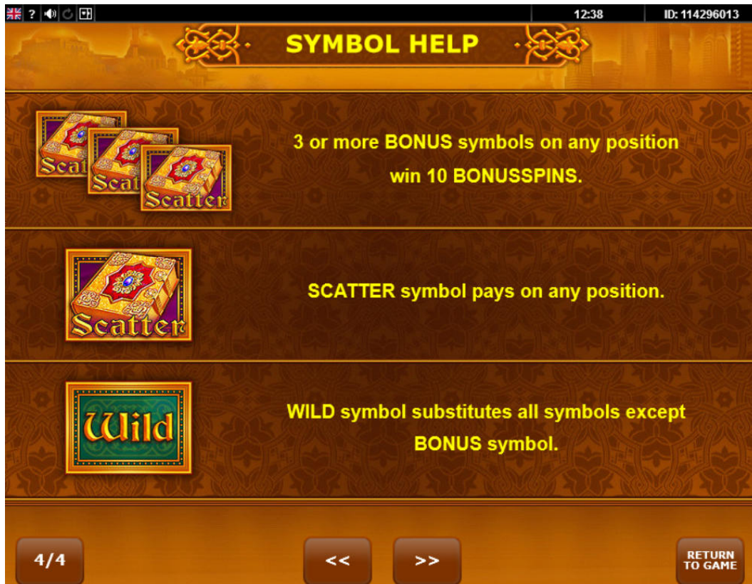
Help Screen 4