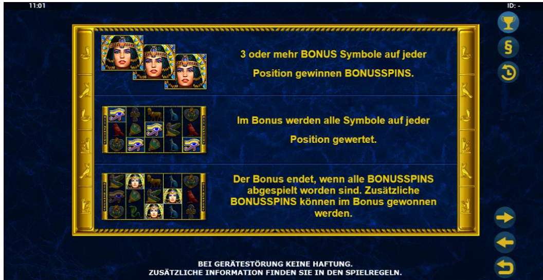
Help Screen 4