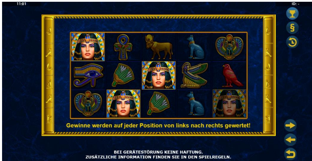
Help Screen 2