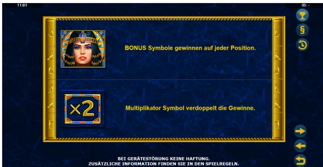
Help Screen 3