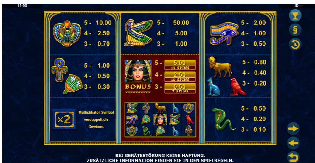
Help Screen 1