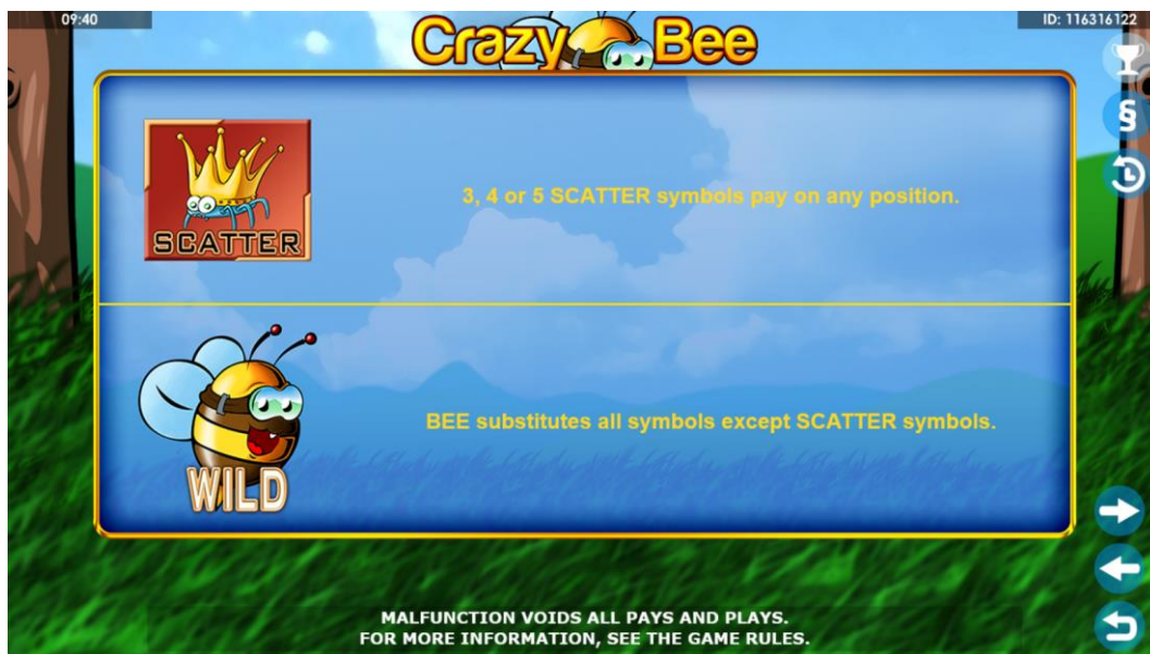
Help Screen 3