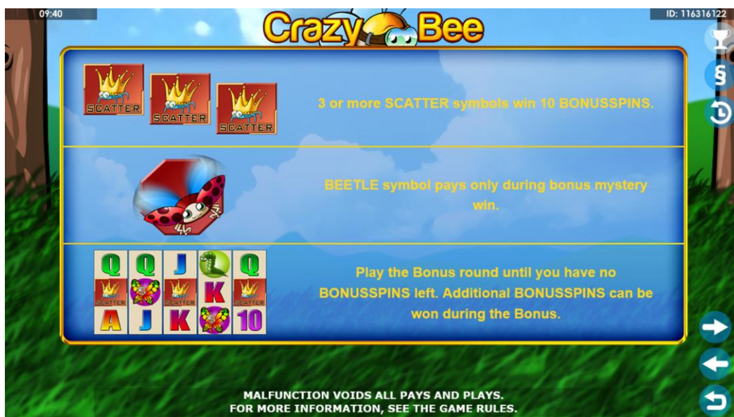
Help Screen 4