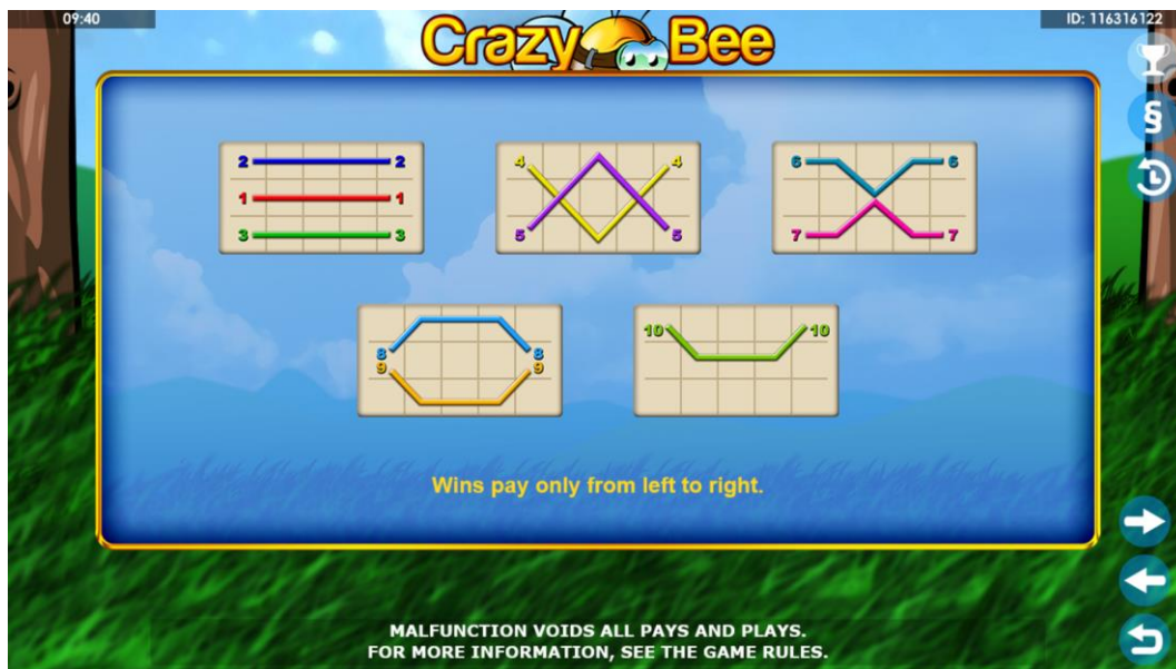
Help Screen 2