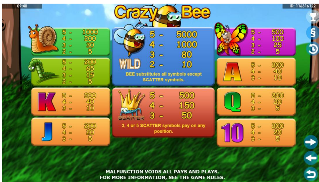
Help Screen 1